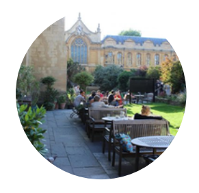
Vaults & Garden | 1 Radcliffe Square

Amidst the hustle and bustle of Oxford's city centre, tucked away above a bicycle shop, you can find the Handlebar Cafe. Enjoy a wide selection of hot or cold lunch options, all homemade with ingredients carefully sources from local suppliers, in this guirky cafe.